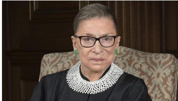
Ruth Bader Ginsberg 1933-2020

Ruth Bader Ginsberg is known for a lot in regards to women’s rights and ground breaking decisions on the SCOTUS, but her entire life is one that is worth studying. One quote from her that talks about dissent we can all reflect on is this: "Dissents speak to a future age. It's not simply to say, 'My colleagues are wrong and I would do it this way.' But the greatest dissents do become court opinions and gradually over time their views become the dominant view. So that's the dissenter's hope: that they are writing not for today, but for tomorrow."