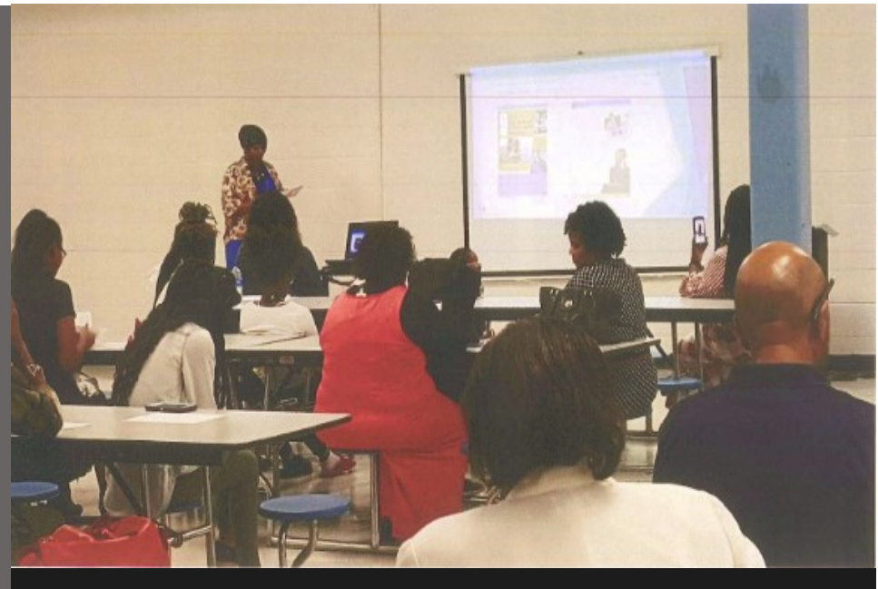
Parents receiving valuable information at a school's parent night

Additionally, the Title I department will provide training to principals during the 2018-2019 district summer leadership team summit and will post a webinar so principals will understand parent and family engagement requirements and plan opportunities for family engagement activities and meetings for the remainder of the school year.