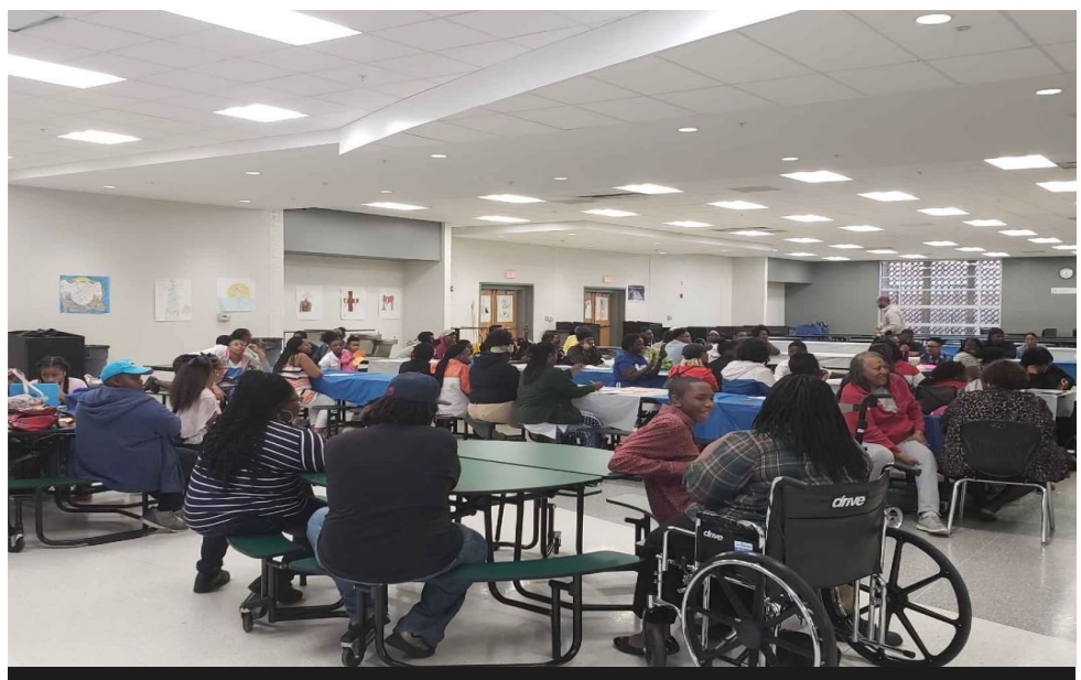
Parents listening to principal's greeting at a Title I end-of-year input /revision meeting