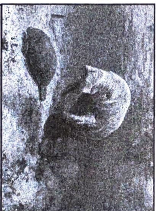
These are two manatees in the sea.

Some people call them gentle beasts because of their sheer size, yet delicate movement. Manatees can grow up to twelve feet long and weigh up to 1,800 pounds. They can live for up to sixty years in the wild but are endangered now. They face dangers such as getting caught in fishing nets or even getting too close to boat propellers.